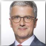
Rupert Stadler Audi