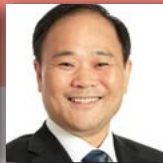
Li Shufu Geely & Volvo