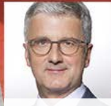
Rupert Stadler CEO Audi