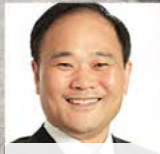
Li Shufu Chairman & Founder Geely & Volvo